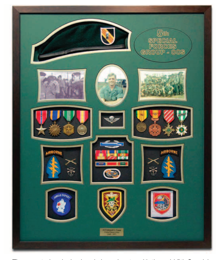
The mounted and raised oval-shaped mat—with the gold 5th Special Forces description written in the top right corner—was designed with GMC software using a standard Text template.

Because of the custom shapes required for the different