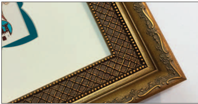
Adjoining stacked frames, rather than overlapping them, allows you to see the decorative outer edges of the frames that would otherwise be obstructed.

tern. Cut the short lengths and trim them until you have corresponding corners to match the long lengths. Cutting a bamboo frame in this manner gives the frame continuity, and shows your client that you've taken some extra care with their frame. Make sure to point this feature out to them when they come in to collect their framed piece.