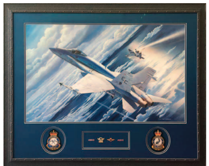
When matching a pattern, make sure that the pattern on the second cut of your length of moulding is a mirror image of your first cut before using your saw.

For bamboo-style mouldings, try matching the corners. Start with the longest lengths first, and cut them to size. Don't be concerned about centering the pattern in this instance. Lay the frame on the work bench. Take note of whether the cuts are on a high or a low section of the pat-