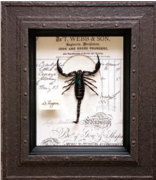
This eye-catching scorpion piece demonstrates the added wow factor that comes from stacking frames. Additionally, matching the pattern ensured a pleasing symmetry on the outer frame's evenly spaced circular ornaments.