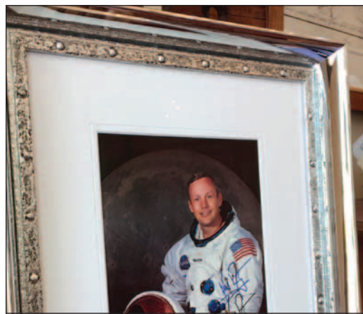
This signed photo of Neil Armstrong is surrounded by a custom aluminum-gilt, pattern-matched inner frame and a deep chrome adjoining outer frame.