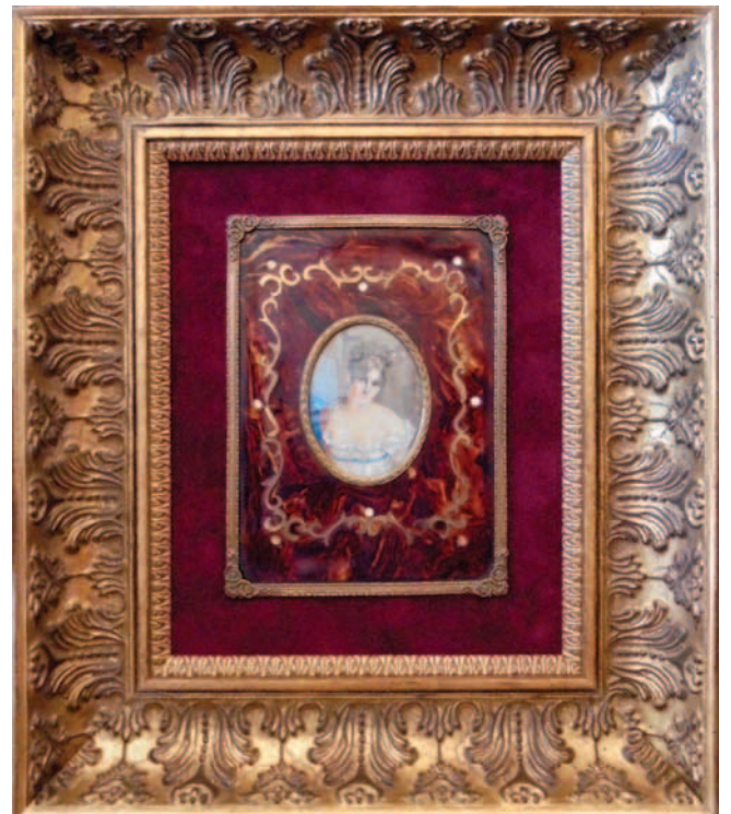
Centering the pattern on this large, ornate frame allowed the entire design to reach its full potential.