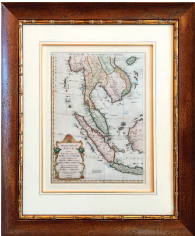
The clean lines of the matting and outer frame on this custom map piece are carried over into the pattern-matched inner gold frame.

To achieve an adjoining stacked frame, cut and join the inner frame as usual and match the pattern, if required. Carefully measure the outer edge of this frame, and add approximately 1/4". Set the measurements on your saw to