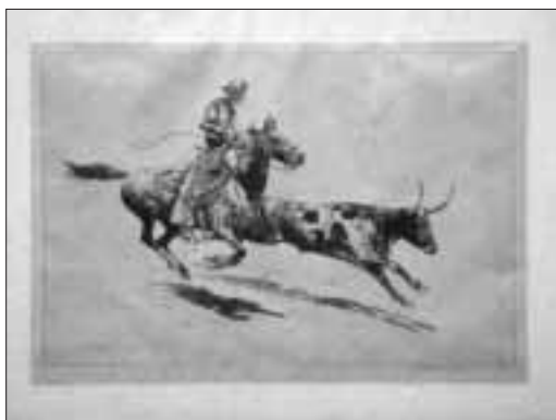
The backing board used to frame this print turned acidic, staining and darkening most of the print.

The answer to that question is complex. How the artwork was created, where it has been and under what conditions, and what kind of care or treatment it has received all affect its future care. The more you know, the better care you can give. This care starts with your decision to frame and display your art. When framing, consider these questions: