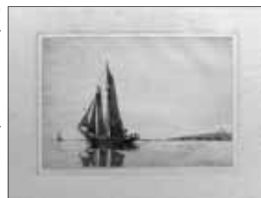
The top mat used to frame this piece darkened the edges of the print.

Art, like everything else, needs constant care. Sometimes this care and maintenance should be performed by a trained specialist. When in doubt, ask. Making informed decisions about framing your art will add to your enjoyment of it and improve its condition and longevity.