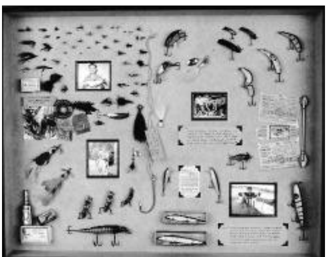
Using programs, tickets, photos and other mementos in a framing design adds a whole new dimension to the piece.