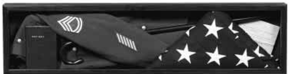
Framing uniforms and other personal belongings highlight the soldier's time in the military. Note that the United States flag is folded correctly, with no red or white stripes visible.