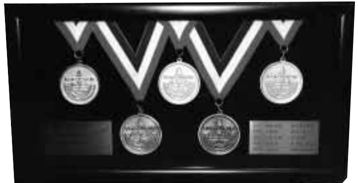
The alternating heights of these hanging medals give each its own space within the frame.