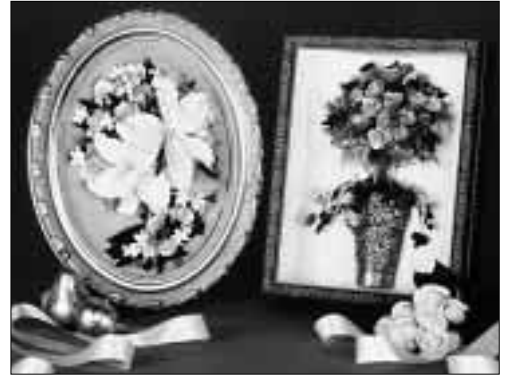
Flowers can be preserved in a variety of ways, many of which are suitable for framing.

Bring your floral bouquet into the framing shop today and create a special piece that is sure to enhance the memory of a special event. What's more, your floral keepsake will be a wonderful addition to your home for years to come.