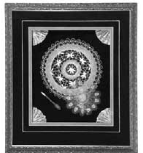
Elegantly framing your souvenirs and mementos can create a reminder of a pleasant journey.

In addition to creating a dynamite way to display your memories, we also have the technical expertise to frame your items in a way that will preserve them for many years to come. There are certain issues to address including protection from fading and other environmental hazards, as well as preventing potentially harmful chemical reactions when working with metal, wood, or plastic mementos. So bring your vacation photos and souvenirs to us and we'll make them part of your everyday life.