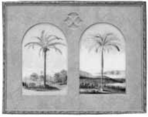
The arched openings in this mat design, and the decorative emblem at the top, help to enhance this pair of palm trees.