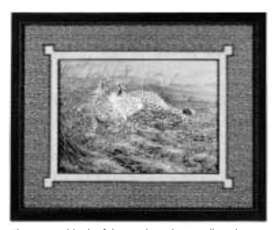
The textured look of this matboard, as well as the eye-catching corner cuts, makes for an interesting frame design.

Textures can make quite a statement when used to line the back of a shadow box project as well. When you see your treasured items positioned against the backdrop of a rich green suede mat, for example, you'll know they've found their rightful home.