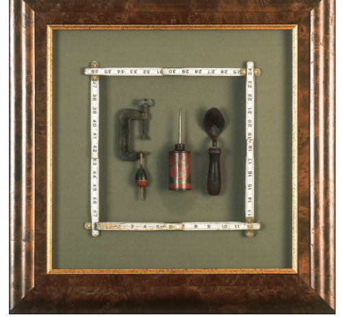
With your unique items, and a little ingenuity, we can create a personalized frame for you.

a tricky proposition. Odd-shaped or weighty items can present obstacles when constructing a shadowbox. But, here at the shop, we're experts in building such things. In addition to using special hardware and other materials for attaching objects, we can plan a custom approach to mounting when the "ready-to-go" techniques are not quite right.