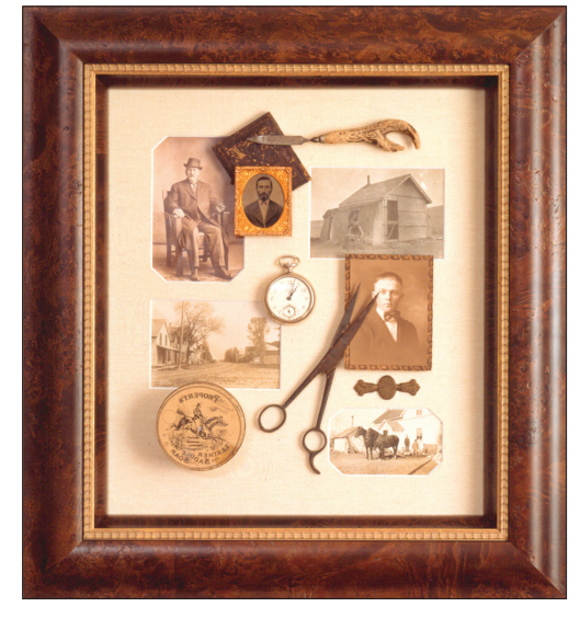
Photos that relate to treasured items can be used to "tell the story" of those who owned them.