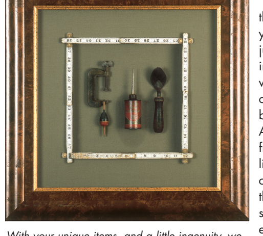
With your unique items, and a little ingenuity, we can create a personalized frame for you.

a tricky proposition. Odd-shaped or weighty items can present obstacles when constructing a shadowbox. But, here at the shop, we're experts in building such things. In addition to using special hardware and other materials for attaching objects, we can plan a custom approach to mounting when the "ready-to-go" techniques are not quite right.