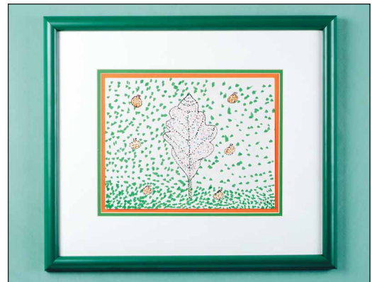
Bright colors are always a popular choice when framing children's art.