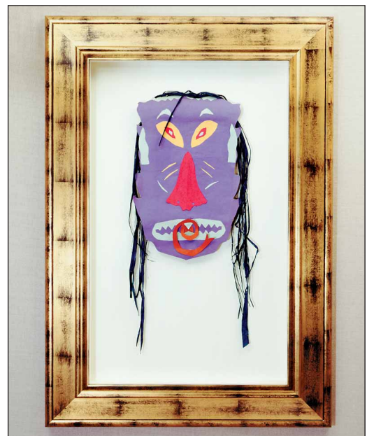
3D objects creatively framed create a focal point for a room.