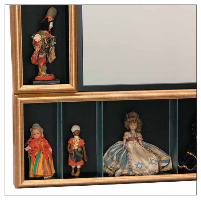
The dolls were placed in size order to be aesthetically pleasing.