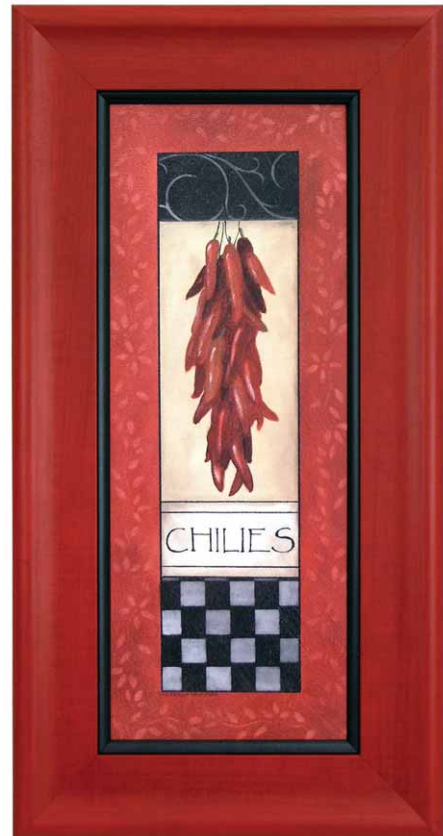
The red Colori frame from FramERICA echoes the heat from the chili pepper artwork. The Colori line features 15 profiles in seven colors. Matching fillets add to the versatility of the collection.

We will help you keep up with the latest trends or stay traditional—either way you can liven up a room—by using colorful frame designs in your home decor. Stop by and see us soon. ■