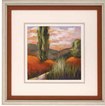
This colorful landscape is framed with metal on the inside and wood on the outside. Outer Frame: Nurre Caxton Moncada Collection. Inner Frame: Nielsen 41-E213 Coin Copper.

Texture and color are both important factors. Landscapes can look richer and brighter when the right color choice is used. Follow the texture of the art through to the frame design. Do you have a photographic print that will be enhanced by using its non-dominant color on both the metal and wood