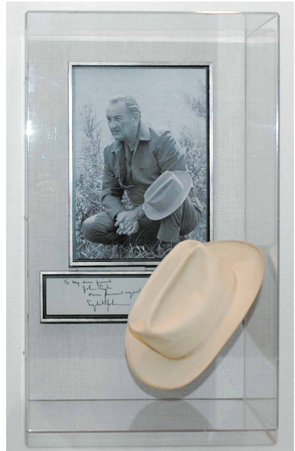
The creatively designed acrylic showcase not only prominently displays the LBJ photograph and Stetson hat, it preserves it as well.

We welcome your unique oversized items and are up for the challenge. Stop by our design counter and let us show you how your treasures can be designed to fit your decor and create memories to last a lifetime. ■