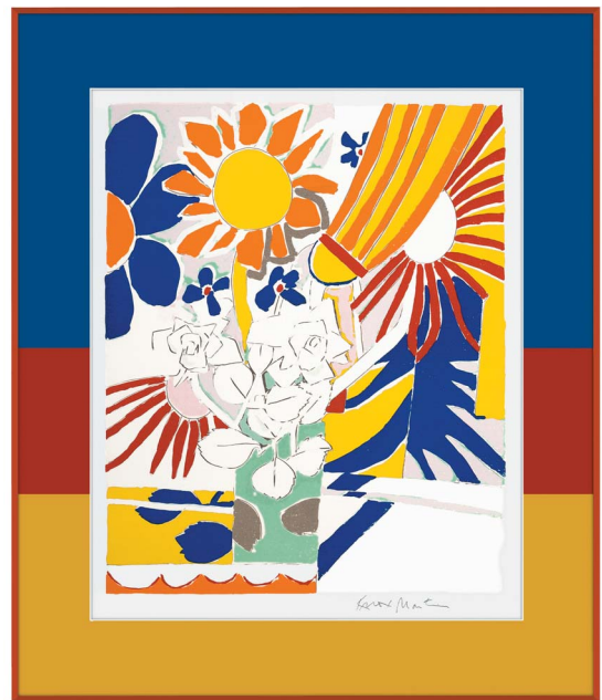
Bands of color create the mat for this vibrant work. The contrasting frame adds to its beauty.