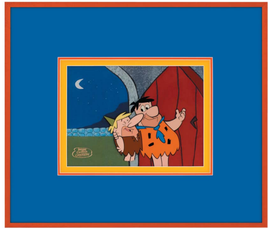
Fred and Barney are surrounded with color using bright colored mats with a complementing tangerine frame.

All frame designs courtesy of Gibson Glass and NielsenBainbridge