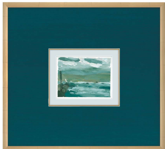
A small painting surrounded by a rich mat and frame will surely be a focal point of any room.