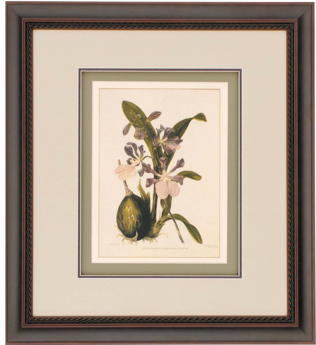
This botanical moves beyond the ordinary with a beautiful combination of layered mats. The mahogany frame completes the elegant look.