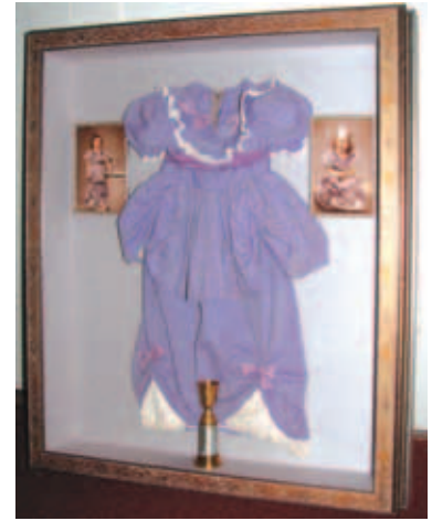
Precious childhood memories and keepsakes, like this baby dress and pageant trophy, can be preserved in the perfect setting.

Of course, when it comes to framing cherished objects, it is important to remember that less is more. We can help you choose key elements to include in a design. For example, framing the ticket, scorecard, program, ball, glove, and Cracker Jack box from your first baseball game may be a little overwhelming. Why not choose two or three elements to focus on. Your ticket and scorecard will capture the moment nicely. ■