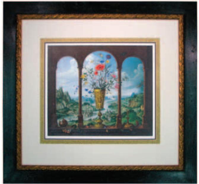
Inlays work with almost any style and add significant amounts of color without adding layers to a finished piece.

Don't let your artwork get lost. We can work with you to decide what design elements work best for your artwork and to show you how bigger mats can add more impact to their presentation. ■