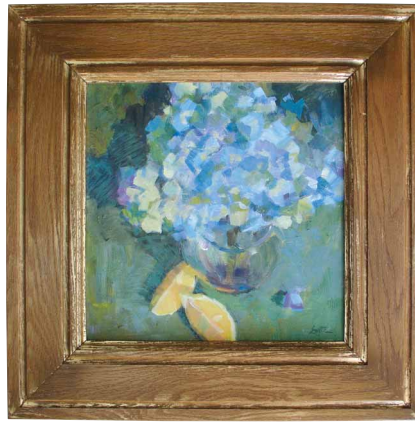
Gilding directly on an oak frame creates a subtle iridescent effect that changes when viewed from different angles.

Gilding directly onto an oak frame creates an iridescent quality that changes when viewed from dif-